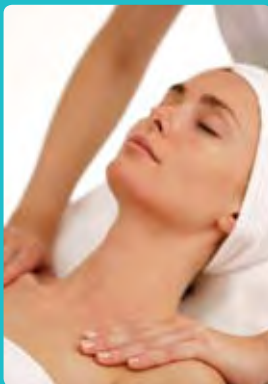
Spa vouchers make great gifts - call us.